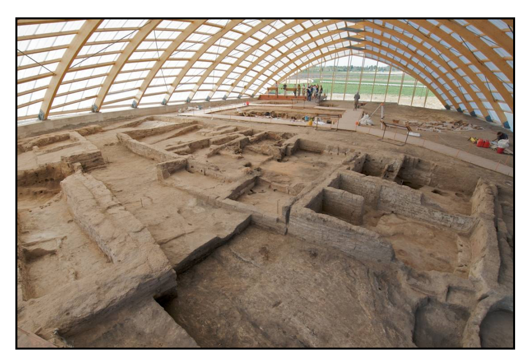
General view from the excavations in 4040 Area