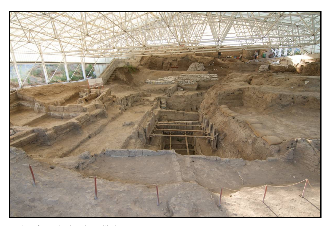
A view from the Southern Shelter

Excavation has been conducted on two of Çatalhöyük East's distinct eminences. The Southern Area, excavated by Mellaart, demonstrates the development of architecture through the whole sequence of the site. Of particular significance are sequences of buildings in 'columns' of houses. These sequences of houses stacked one on top of the other over time have provided much clear evidence for strong micro-traditions and repetitive practices that almost certainly indicate long-term occupancy by the same group. The Northern Area (encompassing the North, BACH, and Area 4040 excavations) reveals the variation among contemporary buildings, with houses grouped into small clusters that likely shared ancestral burial houses, as well as larger-scale groupings into sectors of clustered houses bounded by midden areas and/or alleyways.