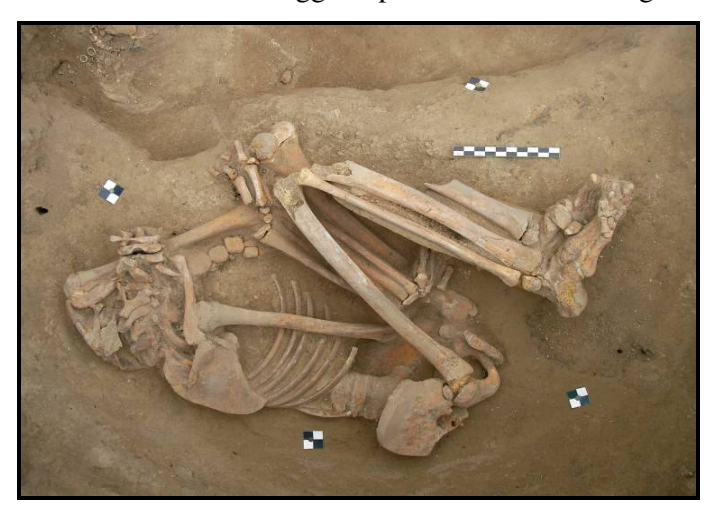
Neolithic child buried with head removed in aplatform in area 4040

Some houses were used as 'ancestral' burial locations where people were preferentially buried. Certain houses had up to 60 burials in one house, others as few as 2 or 3, and some none at all. There is extensive evidence for the circulation of human body parts taken from burials beneath the floors of houses. Adult men and women have been found at the site with their heads or limbs removed after burial. There is also a case in which a plastered male skull was discovered in the arms of an adult female. Teeth from earlier burials were sometimes taken and placed in jaws in later burials in rebuilds of the same house (Hodder 2010). Once removed body parts may well have circulated for some time before being specially placed in specific abandonment or foundation contexts, such as the base of the posts that supported the house walls. All this suggests particular rather than generic links to ancestors (Hodder 2006).