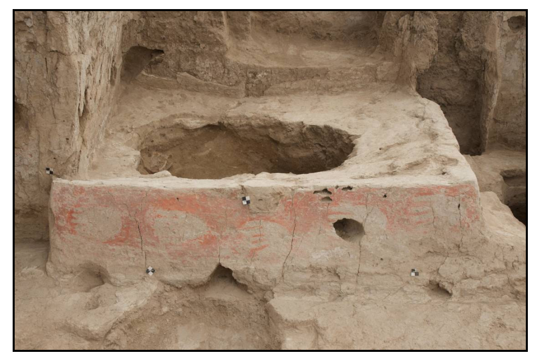
Red painted plaster with hands on area 4040

Mellaart's excavations uncovered a number of relief sculptures , figures modeled in clay on the walls. These include modeled heads of cattle and other animals, as well as a number of representations of the entire body of animal figures, which can be divided into two types: pairs of spotted leopards facing each other and splayed figures. In all cases, the splayed figures' heads, and usually hands and feet, have been knocked off in antiquity. It has never been clear whether these were meant to be humanoid, animal, or a therianthropic blend. A stamp seal found recently at the site strongly suggests that these are animal figures, probably bears.